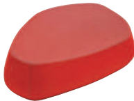
Fjord Stone Foot Stool

#TK0V7-T Revolving Footstool 25 1 / 2 "w. x 24 1 / 4 "d. x 13 3 / 4 "h. Both in Black Tony Leather with Rifle Brown Base