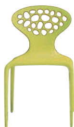
Supernatural Chair #SU156 20 3 / 4 "w. x 20" d. x 32"h. Stackable