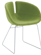
Fjord Dining Armchair

#FJOV6-T Black Front, White Back, Black Base and White Stitching, Swivel Base 34 1 / 4 "w. x 24" d. x 25 1 / 4 "h.