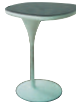
Bloomy Side Table

#PH0HP/OHK Oval Black Laminate or Red/Black Stripe Veneer Top 55"w. x 40 1 / 2 "d. x 13"h. Black Base