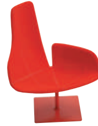
Fjord Relax Armchair

22 3 / 4 "w. x 21 3 / 4 "d. x 28 3 / 4 "h. White Shell and Base