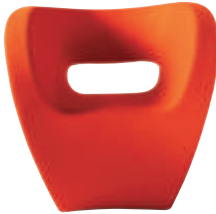
Victoria and Albert Armchair

37 1 / 2 "w. x 31 1 / 2 "d. x 40 1 / 4 "h. Red Tony Leather, Aluminum Grey Base and Beige Stitching