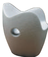
Nest Armchair* #NN042 Polyethylene Available in White, Black or Fuchsia 26" w. x 27 1 / 4 "d. x 30 1 / 4 "h.