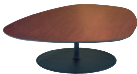
Phoenix Low Table

Lacquered Table 13 3 / 4 "w. x 17"d. x 17 3 / 4 "h. Black or Red