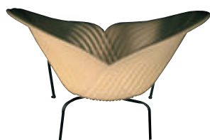
Ripple Chair #RC050 Fiberglass White Shell with Black Stainless Base 26 3 / 4 "w. x 23 1 / 4 "d. x 31 1 / 2 "h.