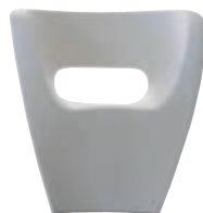
Little Albert Armchair #VA042 in Chalk White or Translucent #VA161 in Red or Black High Gloss Lacquer 29 1 / 4 "w. x 24 1 / 2 "d. x 27 1 / 2 "h.