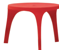
Victoria and Albert High Table #VA03W Rotational Molded Polyethylene Translucent White 35" w. x 35" d. x 27 1 / 4 "h.