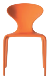
Supernatural Chair #SU050 20 3 / 4 "w. x 20" d. x 32"h. Stackable

Your Chairs and Tables come with a 1 year structural warranty - limited to the original end use.