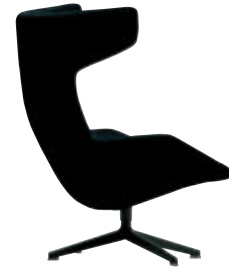
Take a Line For a Walk

#BM001-Q White/Black 33 3 / 4 "w. x 33 3 / 4 "d. x 28"h. Upholstered with Removable Covers